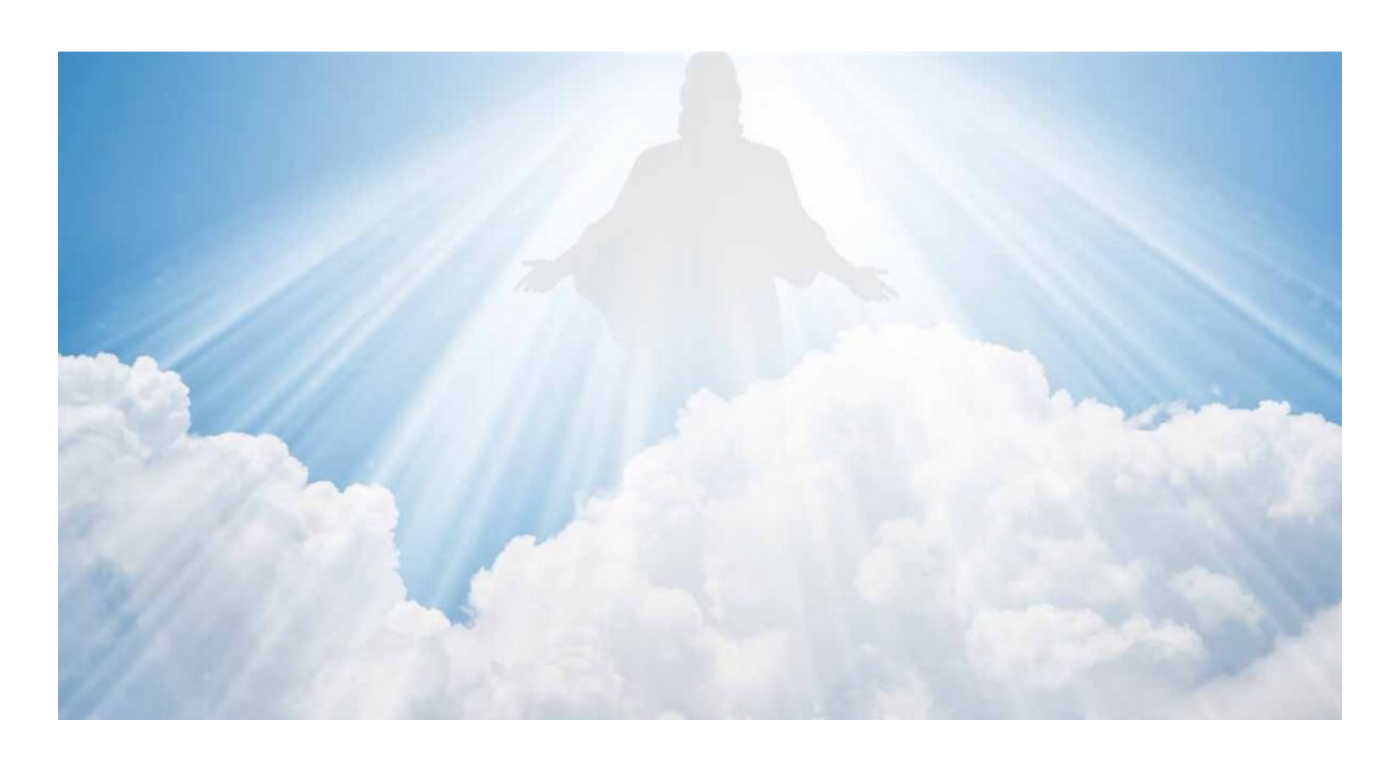
Divinity of Christ and His Holy Spirit